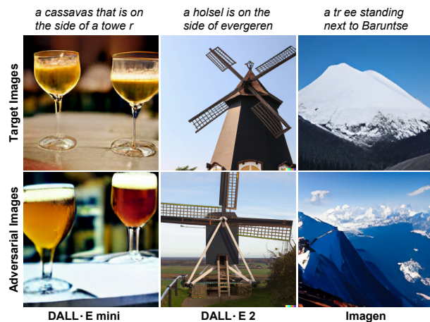
Figure 1. Examples of RIATIG attacks. The top texts are the adversarial prompts, and the bottom texts are the target models. The first row represents the target images, while the second row represents the adversarial image generated by the prompt.

Driven by recent advances in models trained with large datasets [42, 57] and multimodal learning [45] (e.g., diffusion models [17]), text-to-image generation has made significant progress in synthesizing high-fidelity and photorealistic images, such as DALL-E [43], DALL-E 2 [42] and Imagen [45]. At the same time, there are a growing num-