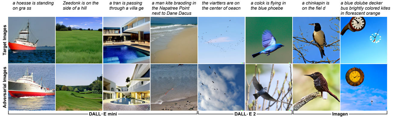
Figure 4. Examples of our adversarial attack results against DALL-E mini, DALL-E 2, and Imagen.